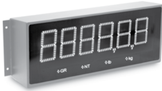
LaserLight 4 in Digit