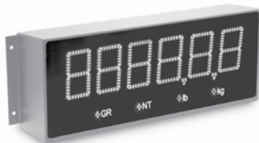
LaserLight 6 in Digit