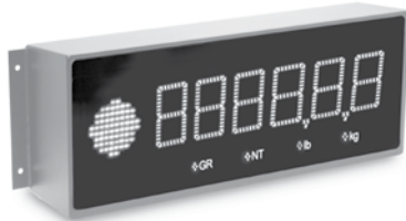
LaserLight 4 in Digit with Stop and Go Lights